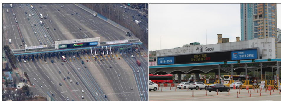
Figure 1. Seoul expressway toll collection system of the Korea Expressway Corporation.

This study analyzed the trend of traffic inflow volume from other areas from January 2020, when the first COVID-19 case was